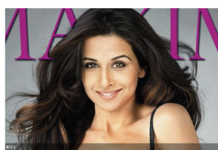
Vidya Balan in a bikini!